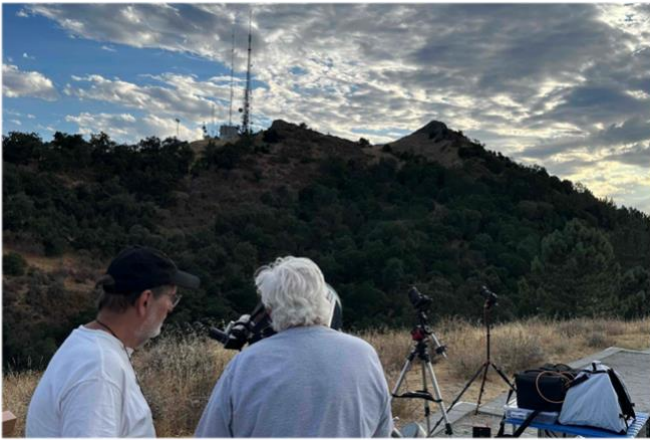
Pat and Rob set up the 10" SCT on the Losmandy mount, weather moved in but the program succeeded