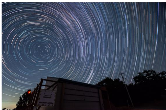
Star trails over FPOA, Chanan Greenberg

Moving on, It's September again, and the Sun has entered the constellation Virgo. This means that the Autumnal Equinox is almost upon us. The equinox is not a day; it's the time when the geometric center of the Sun aligns with the Celestial Equator. For northern California, the equinox will