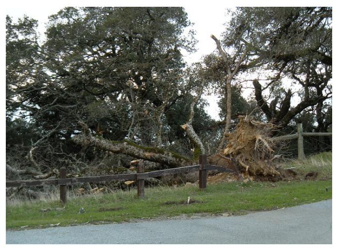
Up-rooted Oak at Park entrance

The observatory suffered minor damage to the rolling roof system. One turnbuckle hook was pulled from it's wood mounting stud and the roof had been moved about one inch from it's fully closed position. We also have a new roof water leak in the SW corner of the Meeting room, probably from wind driven rain. Ranger Derek Davis estimated wind speeds of 80 - 90 mph.