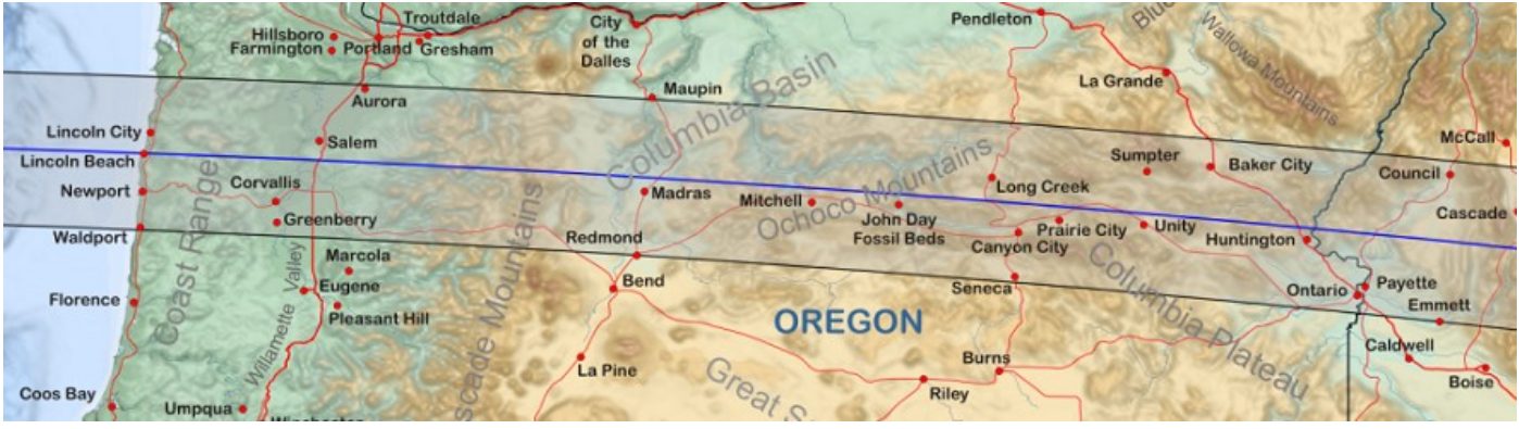
Continued Page 3

Living in the West we have the best weather prospects, but to experience totality will mean a drive. Here is the path in Oregon. Everywhere within the band will experience totality, but totality will be longest toward the centerline.