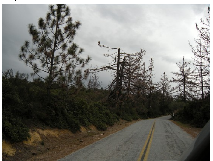
Dead Pine trees with tops broken off

This winter's storms caused extensive wind damage inside and outside the park boundaries. Weak or dead trees were broken or uprooted and fell onto San Juan Canyon road. Power lines were damaged causing intermittent or no power to the park for six days.